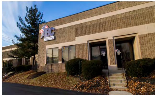
ABC Allentown Office 894 Marcon Boulevard Suite 110 Allentown, PA 18109 (610) 821-9686