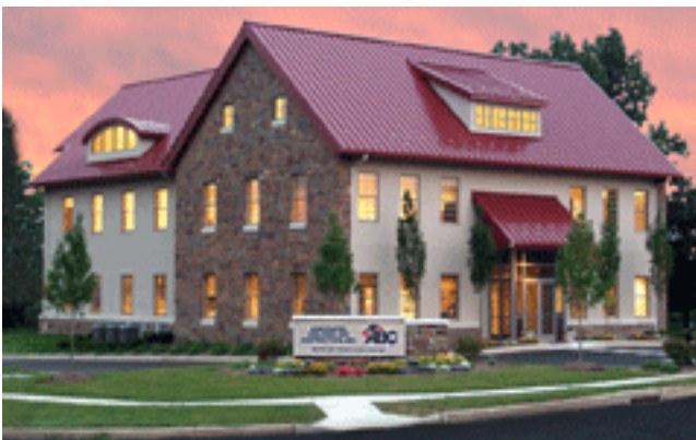
ABC East Norriton Office 430 West Germantown Pike East Norriton, PA 19403 (610) 279-6666

We have two Apprenticeship and Craft Training Centers conveniently located in Allentown and Harleysville to serve the training needs of ABC members and the public.